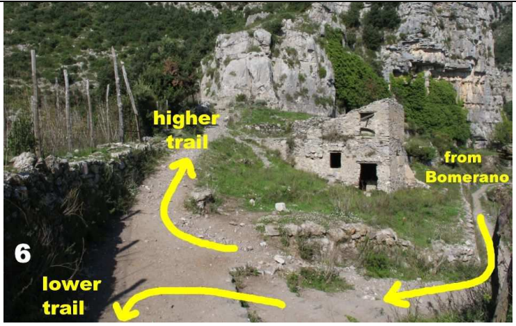
150yd/m past the rocky pinnacle you get to Colle la Serra junction. Here you must choose your trail: lower or higher