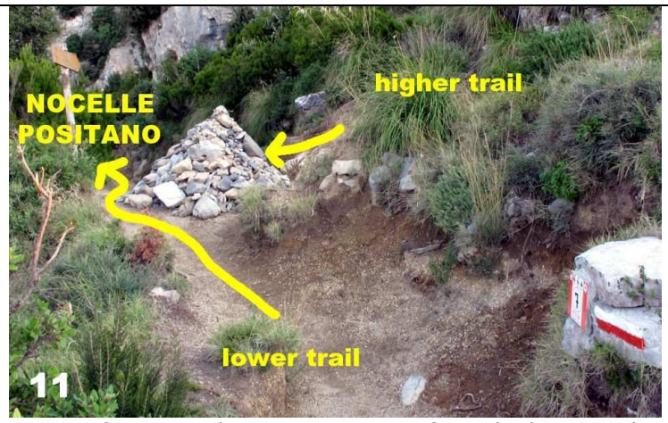
view of Cisternuolo junction arriving from the lower trail. It is at the top of a tricky, rocky climb, by tile no.7