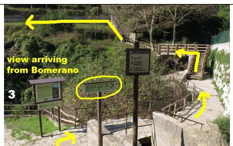
here turn right, walk over the wooden bridge, climb the stone steps to the asphalt road and turn left