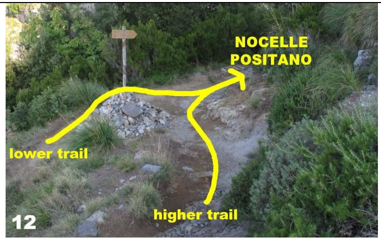
view of Cisternuolo junction arriving from the higher trail. It is at the bottom of a short descent with loose stones

Choosing the route Colle la Serra - Cisternuolo (both are marked with the C.A.I. white/red waymarks)