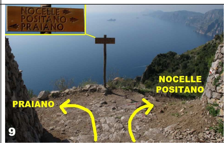
walk about 400yd/450m and at the bottom of a flight of high stone steps you reach San Domenico fork (photo 10 )