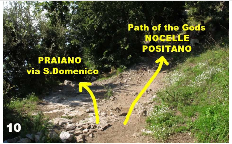
the trail down left leads to Praiano, via San Domenico convent; go straight for Path of the Gods to Nocelle