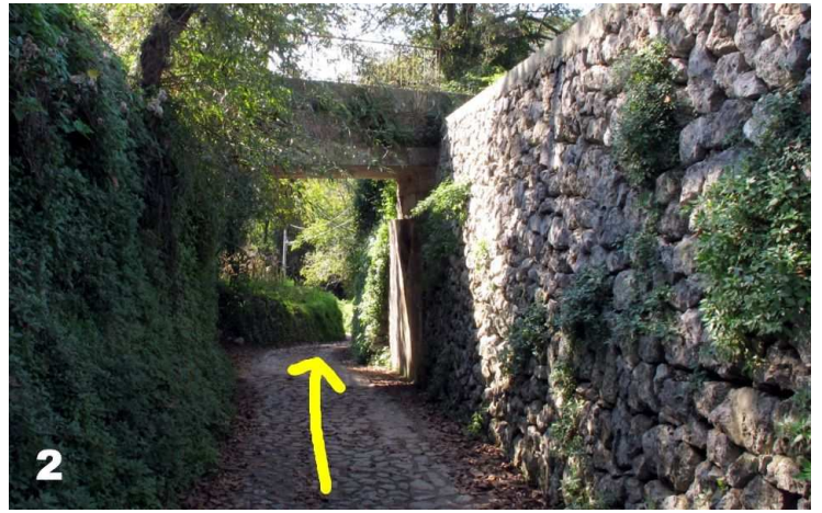
walk down the alley for about 300yd (270m) past this bridge and you'll get to a junction (photo 3 )

don't forget to download your FREE HQ MAP www.giovis.com/maps/deiA4o.pdf