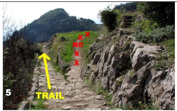
after 500yards of the trail, past a sharp left turn, you come to this fork. Go left (public trail), to the right is private