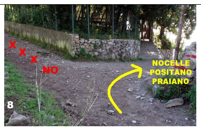
choosing the lower trail soon after the previous T-junction turn right (photo 8) and walk down the steps till photo 9