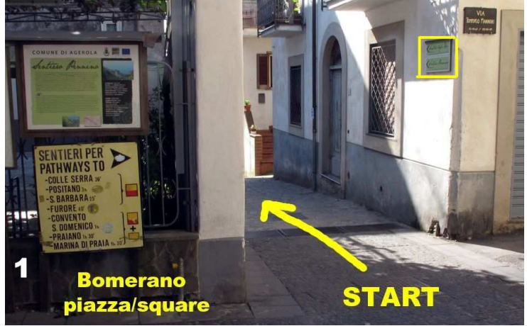
the itinerary starts from Bomerano sq. (sign on the wall), side street to the left of the entrance to Hotel Gentile