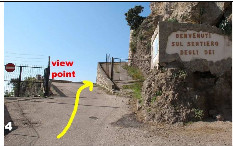
a few metres after the view point the road ends and the trail begins going down the steps by Grotta Biscotto